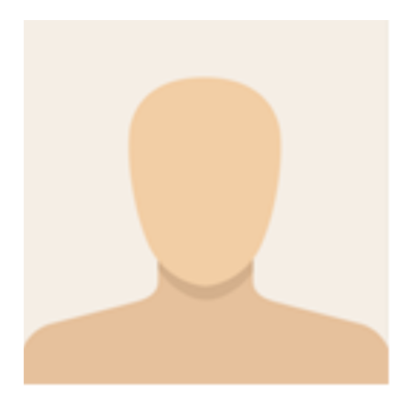
Dion Barbieri RE/MAX Park Estates - St Paul's Bay